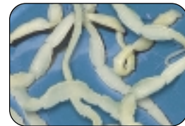
Tapeworm segments e.g. Taenia taeniaeformis

Roundworms also live in the small intestines and shed thousands of tiny eggs, which pass out in the faeces, polluting the environment. Cats and dogs are re-infected by unwittingly eating eggs in the environment. These eggs also pose some risk to children if inadvertently swallowed.