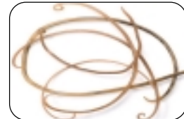
Typical roundworms e.g. Toxocara canis

Remember – just because you don't see any worms doesn't necessarily mean your pet is worm free!