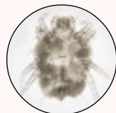
Fur mite (x30) ( Cheyletiella sp. )