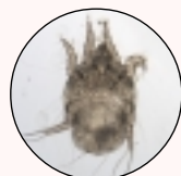
Ear mite (x40) ( Otodectes cynotis )