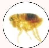
Adult flea (x5) ( Ctenocephalides sp. )

Fur mites are much smaller than fleas and are just visible to the naked eye. Sometimes