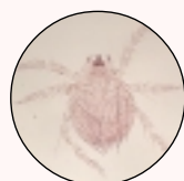
Harvest mite (x40) ( Trombicula autumnalis )

called 'creeping dandruff', they affect dogs, cats and rabbits. The mites cause variable degrees of itching and may also bite the owners of affected pets.